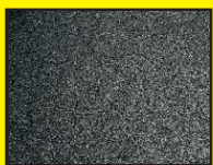
PRESTONE Driveway Heat